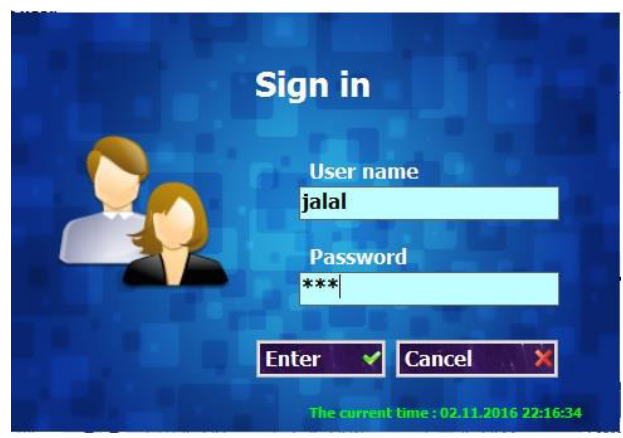
Fig. 2. Authintecation window to input water quality data

Figure 2 shows the login page to input water quality data. The user can input a user name and password), and can change his user name and password.